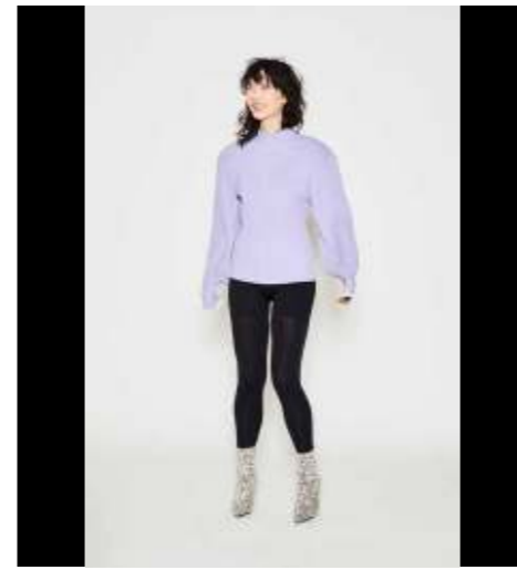
Look 10 Sweater ELLA_lilac