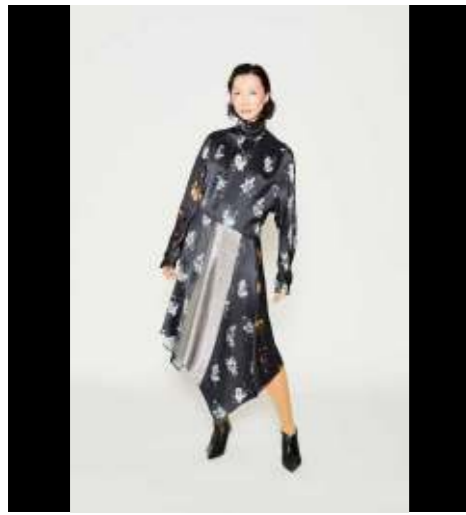
Look 01 Dress AMADA_black_negative