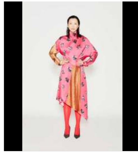
Look 03 Dress AMADA_siegal_pink