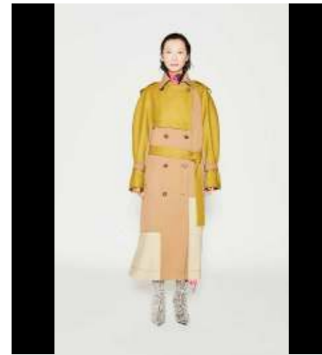
Look 14 Coat MONDRIAN Dress AMADA_siegal_pink