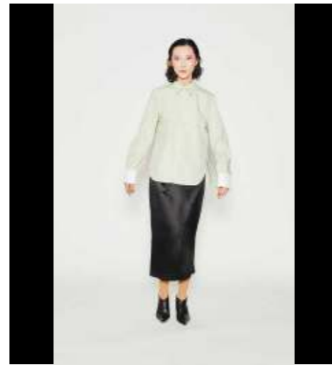
Look 06 Blouse COCTEAU_duval Skirt RUBENS_alaia_black