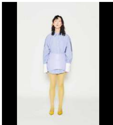
Look 07 Shirt CARACOLEES_stripped Leatherskirt RAANE_lilac