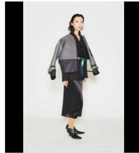
Look 15 Blouson NAGY_100%recycle Jacket NAGY_alaia_black Skirt RUBENS_alaia_black