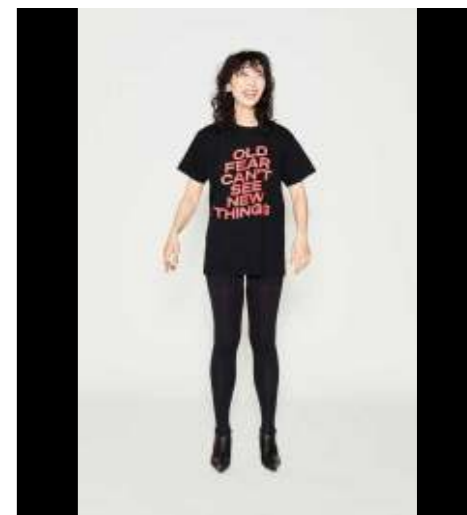
Look 18 T-Shirt OLDFEAR_alaia_black