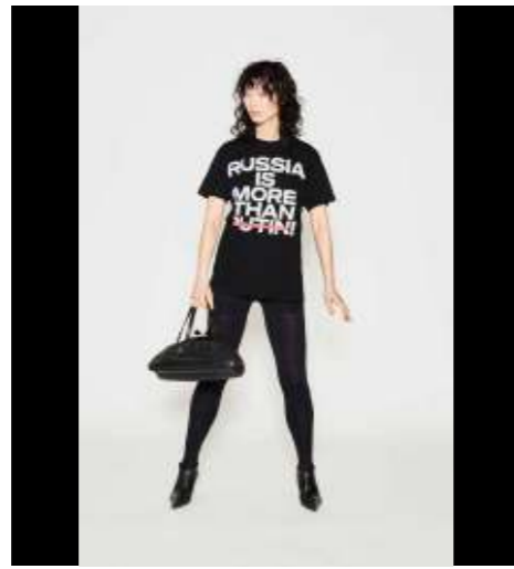
Look 19 T-Shirt STOPHIM!_alaia_black