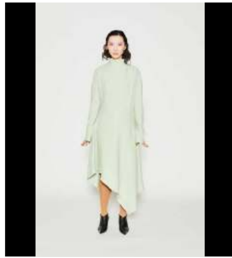
Look 02 Dress AMADA_duval