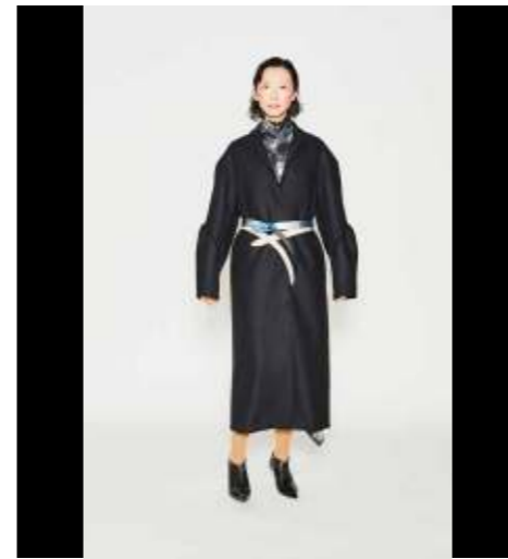
Look 13 Coat MARCIA_alaia_black Dress AMADA_black_negative