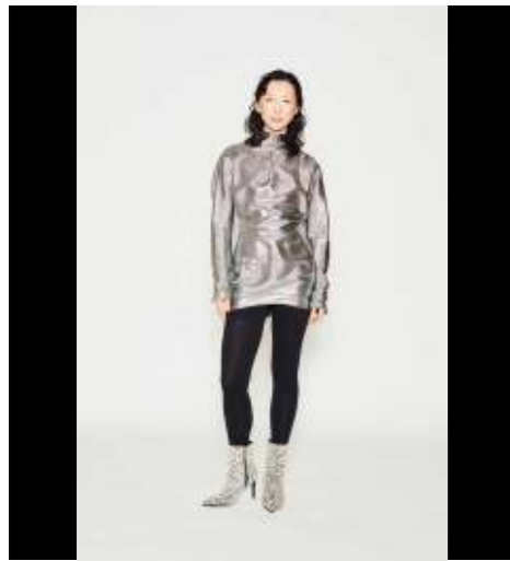
Look 04 Dress ANDO_reflective_silver