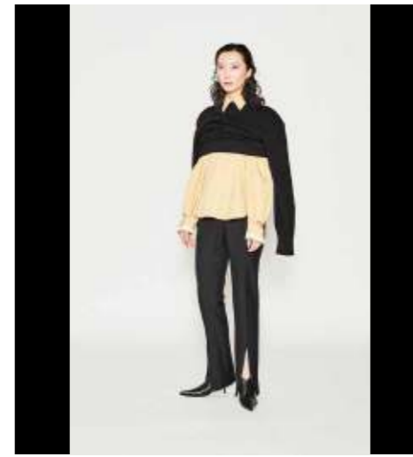
Look 11 Sweater ELLA_alaia_black Blouse COCTEAU_anish Trousers GUNTA_alaia_black