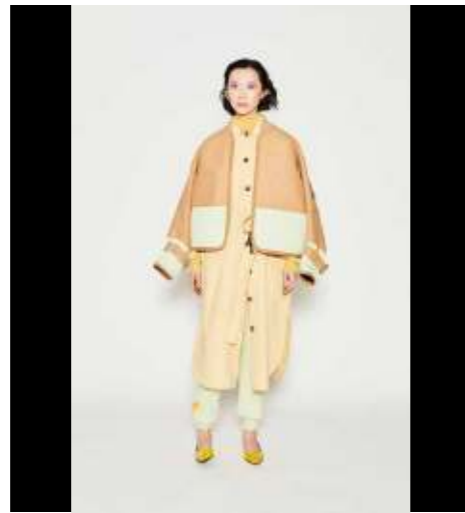
Look 05 Turtleneck ETEL_anish Blouson NAUMANN_anish Dress ANA_anish Sweatpants EMILIE_duval