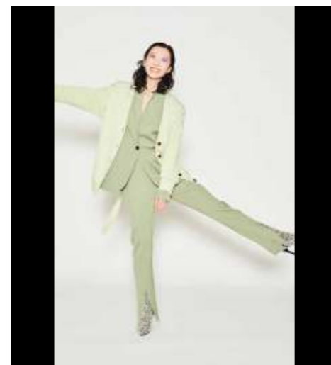
Look 16 Knitcardigan EVORA_duval Jacket NAGY_duval Trousers GUNTA_duval