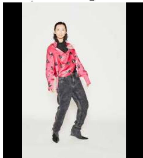
Look 08 Body CHEMNITZ_alaia_black Blouse CADALSO_siegal_pink