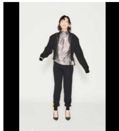
Look 09 Knitjacket EDEN_alaia_black Top CHRISTIE_reflective_silver Knitpants EMILIE_alaia_black