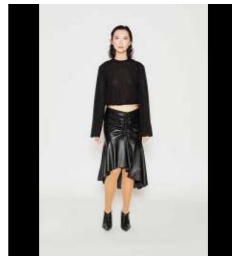
Look 17 Body CHEMNITZ Leatherskirt RACLÉ